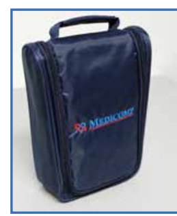
Follow the instructions included in the kit and watch the video at medicompinc.com/patient-center