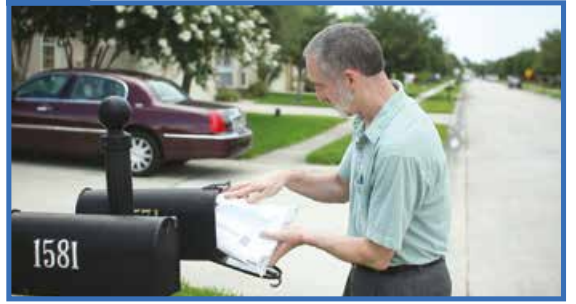
A prepaid return envelope is included in the kit.

Promptly return the equipment to Medicomp.